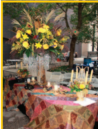
Table prices: Round 4-tops are $125 for members, $175 for non-members. Rectangular 8-tops are $250 for members, $300 for non-members. Sorry, we're unable to provide refunds on reservations cancelled less than one week prior to the event.

Tables may be reserved in advance by contacting Michelle Dietzler at (312) 656-6997 or at dietzler@me.com . Availability is limited and we usually sell out, so please reserve promptly to avoid disappointment . The deadline for table reservations is Friday August 26 th . Tables come furnished with a vinyl cover, but we encourage you to be creative and design your own special, festive tablescape. New this year: Table Awards (Most Elegant, Most Original, Most Beautiful Food, Most Neighborly). Tables come in two sizes: 36" diameter round tables that seat 4 people, and 8' x 30" rectangular tables that seat 8 people.