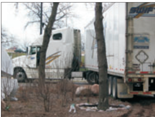
Cul-De-Sac Off Road, Lost Truck