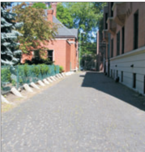
Wooden Alley, West To East (See Page 4 Article)