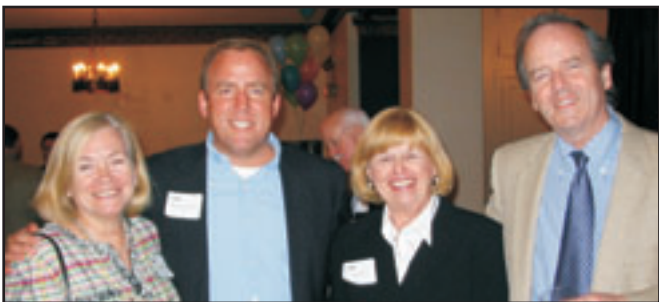
Obviously Happy Guests