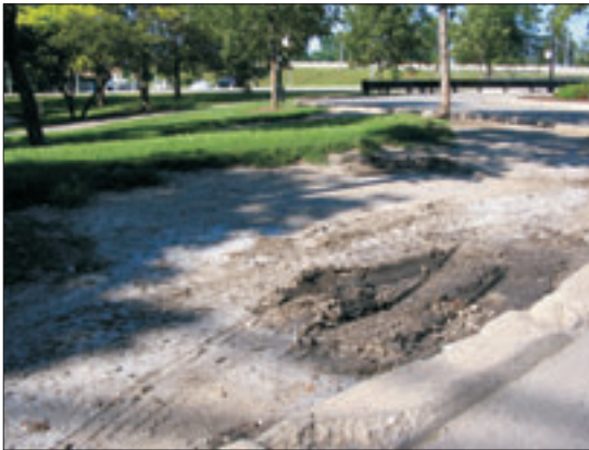
Park District Property, North of North Ave.

NEIGHBORHOOD FIXES - What would you like done to improve the aesthetics and safety of our neighborhood? Examples: (clean up Division underpass; clean up north side of North Ave. signage to stop big trucks from going east on North Ave. past State; Schiller signage at Clark; and the wooden alley). Please write us, see address on the back page with your thoughts.