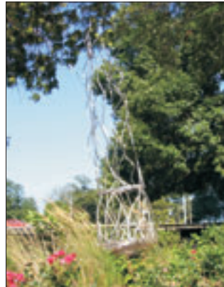
At North Ave. Cul-De Sac