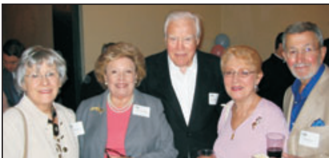
More Happy Guests

WOODEN ALLEY - Late in the 1800s and early in the 1900s many cities in the United States started using wooden blocks to pave their streets and alleys. Wooden blocks were used near hospitals, schools, and in residential areas because they substantially cut down on noise coming from horse-drawn carriages as they used the roadways. Over time, most of these alleys have been removed or paved over with asphalt.