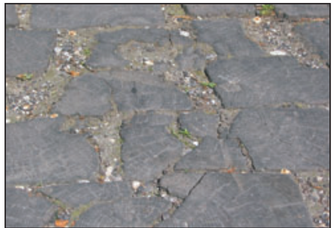
Wood Block Pavers - - Tired. Also, See Photo on Page 2

Either way, please contact us by e-mail or phone with your questions, concerns, and comments, info@goldcoastneighbors.org or (312) 360-0386.