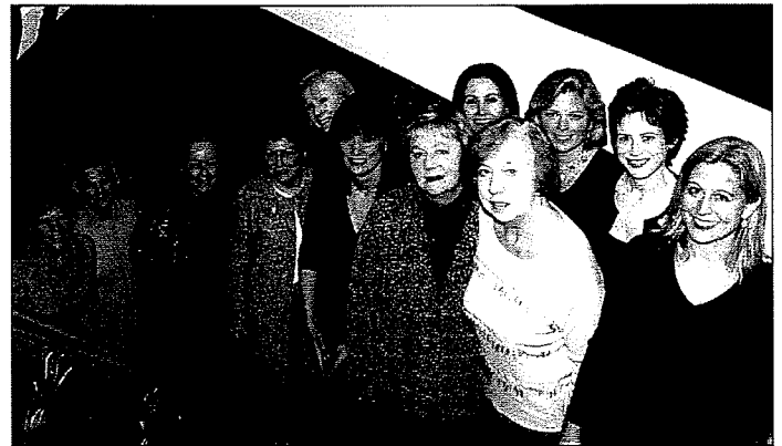
The planning committee for the Echoes Benefit.